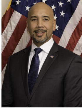
Bronx Borough President