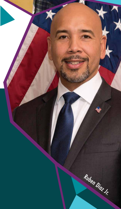
Ruben Diaz Jr.

This year's Sexual Assault Awareness Month has two themes we are bringing to the community in the New York City area: